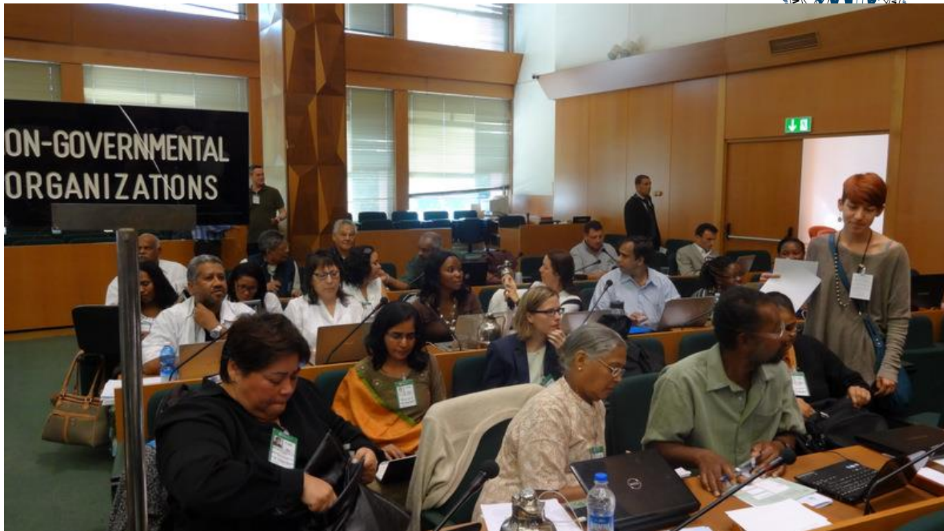
During the intergovernmental technical negotiations in Rome, Italy.