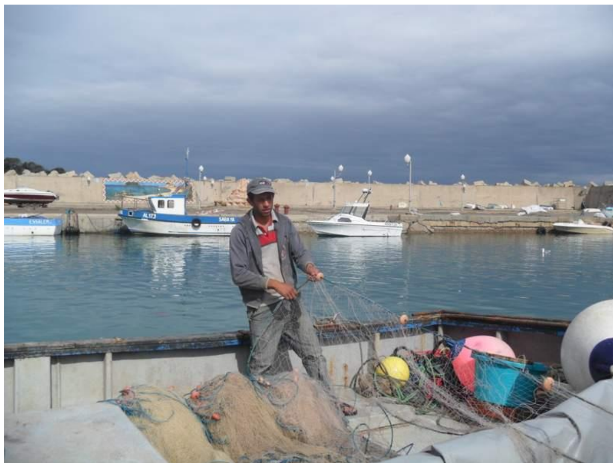
Small scale fisheries from Algeria

It brought together a total of 220 participants from 46 countries, including government, civil society, private sector and academia. Following up on how the voluntary guidelines are being applied in the various parts of the globe is a very important step for all WFF members and it is what we are committed to.