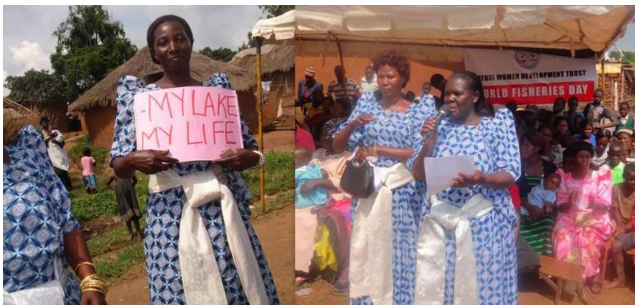
KWDT, WFF member in Uganda, celebrates World Fisheries Day at Nangoma Landing site in Mukono district.

WFF members have engaged in policy discussions with UN institutions, Social Movements, Civil society Organizations and Non Government organizations. Details of these meetings are presented in the report below.