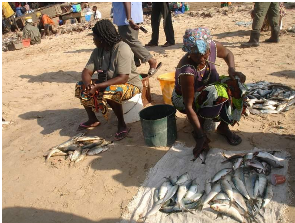
Women fish traders in Mbour Senegal.

Regional policy making processes are very important for small-scale fisheries organizations to know, support and possibly influence. The WFF is committed to supporting its members in following up on policy-making processes in their regions.