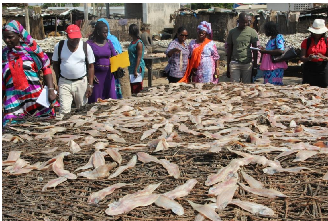
Visit to artisanal fish processing site in Mbour.

The key objectives were to discuss the place and role of women in the artisanal fisheries industry in Africa and to create a platform for exchange.